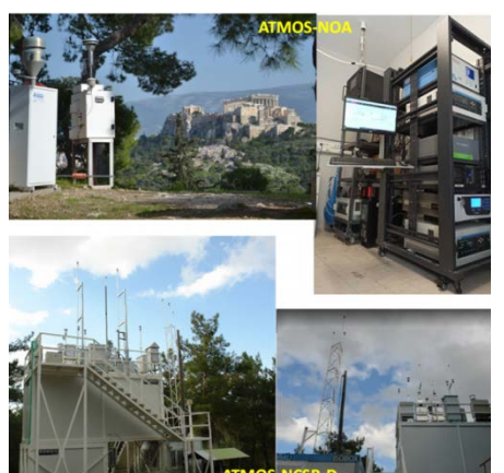
Figure 1: The Athens Supersite (ATMOS) is a distributed Research Infrastructure in Greece and the Eastern Mediterranean. lt is operated by the National Observatory of Athens and NCSR-Demokritos. lt offers sites representing urban background, suburban and regional background for several atmospheric research applications and new instrument testing.

OBS = Observational platform; ASC = Atmospheric Simulation Chamber; CL = Central Laboratories.